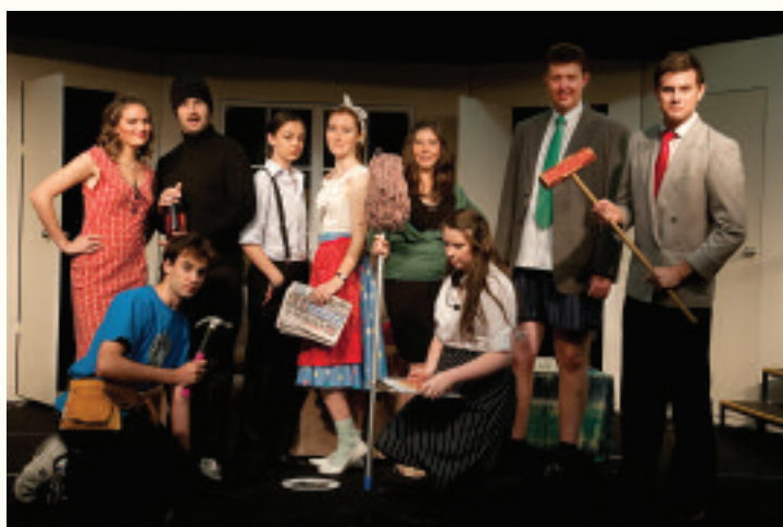
The Cast of Noises Off

It is the time of the year when the lights burn late, when the words on the page become life on stage. Study is in snippets, meals are necessary intermissions, and attending class can help to counteract lack of sleep.