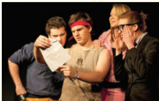
The cast of Revue 2010's main sequence, The Basement .

Scripting and staging a university revue is no small feat. New College is the only residential institution on campus at UNSW to produce an annual revue, and the entire production is the work of New Collegians. Every year the scripts are original, or at the very least clever send ups of existing material, with a main sequence plus a myriad of other sketches, dances, musical performances and movies, which are sometimes vaguely related to the title of the