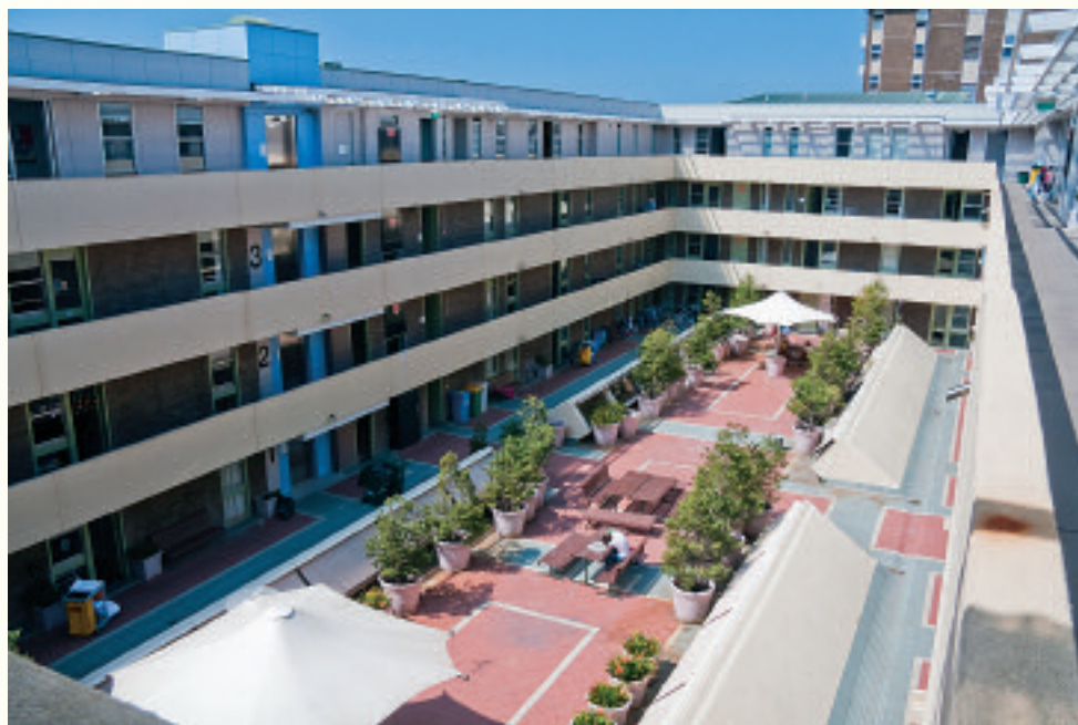
The Courtyard of New College as it was until November 2011.

New College first opened its doors to residents in 1969. Over its 42 years the building has seen a number of transformations, extensions and general upgrades to help serve the original vision. The addition of the Fourth Floor brought 37 new rooms, including 24 regular rooms, two Residential Advisor flats, six disabled access rooms, five ensuite rooms and two large meeting rooms. During the extensions of 2003–04, all of the